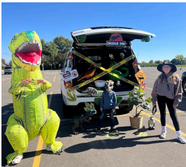
Fall Family Fun Event was a huge success! Thank you Home and School!